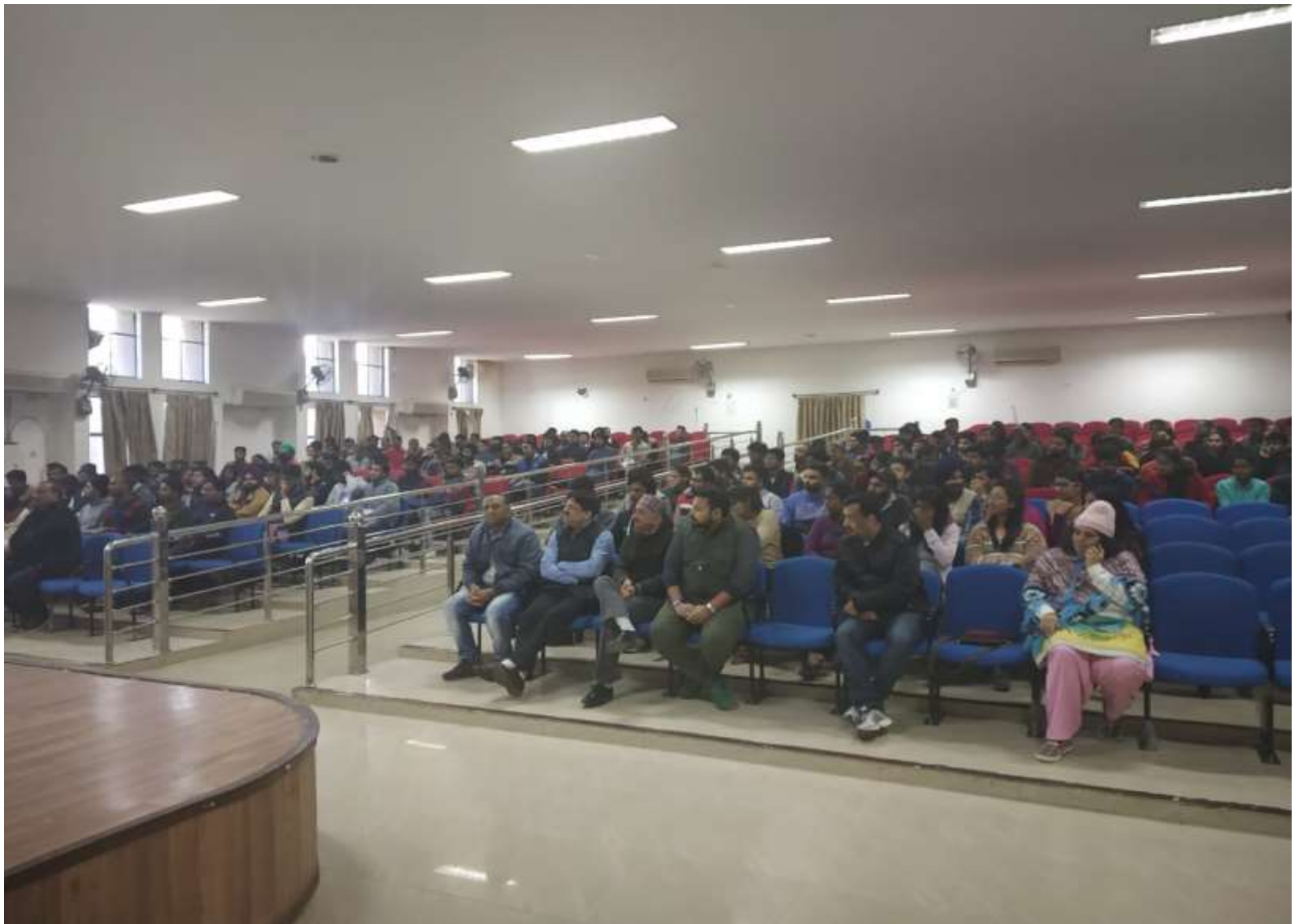
Orientation Programme of GATE Training to UG final year students