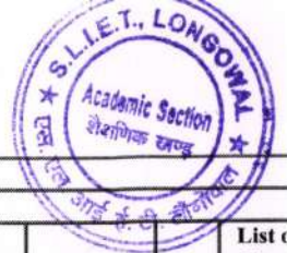
Tabulation Sheet of UG GEE

Semester: 5 (Regular) , EXAMINATION: DEC-2020